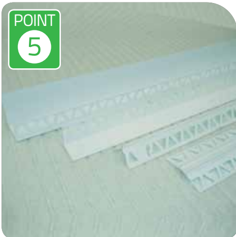
UV Stabilised P.V.C Beading