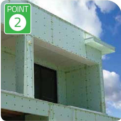
Measure + Cut + Position