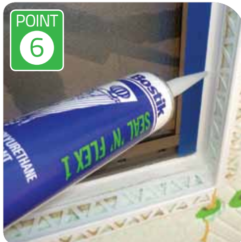
Polyurethane Joint Seals