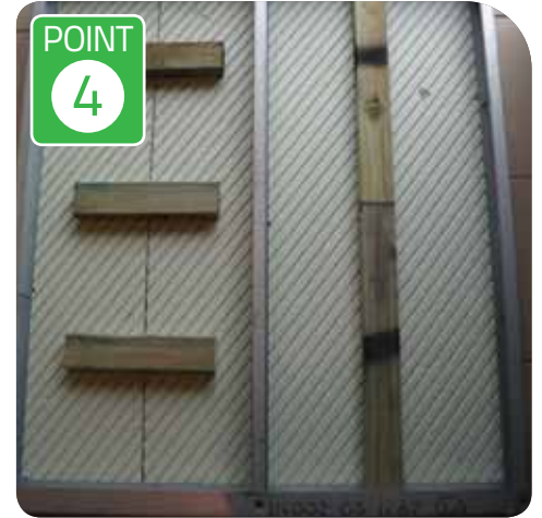
Backblock Off Stud Joints