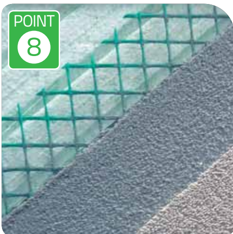
Reinforced Fibreglass Mesh