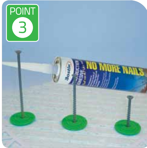
Mechanical Screw Fix + Glue