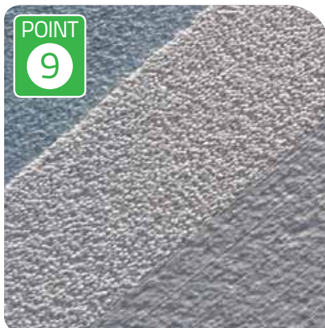
Final Acrylic Texture Coat