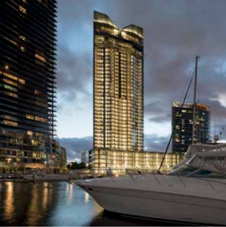
Array by Mirvac.