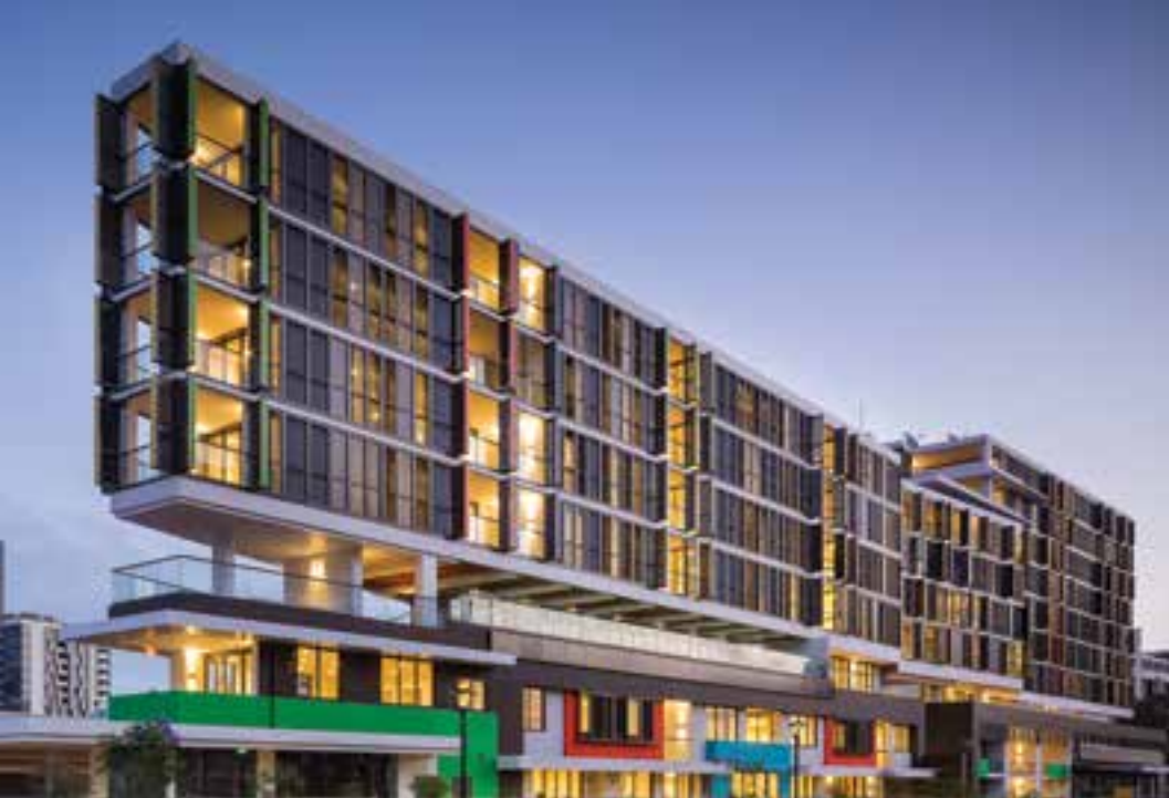
Viking by Crown Group.