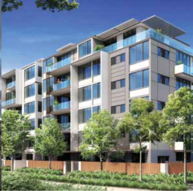
Array by Mirvac.