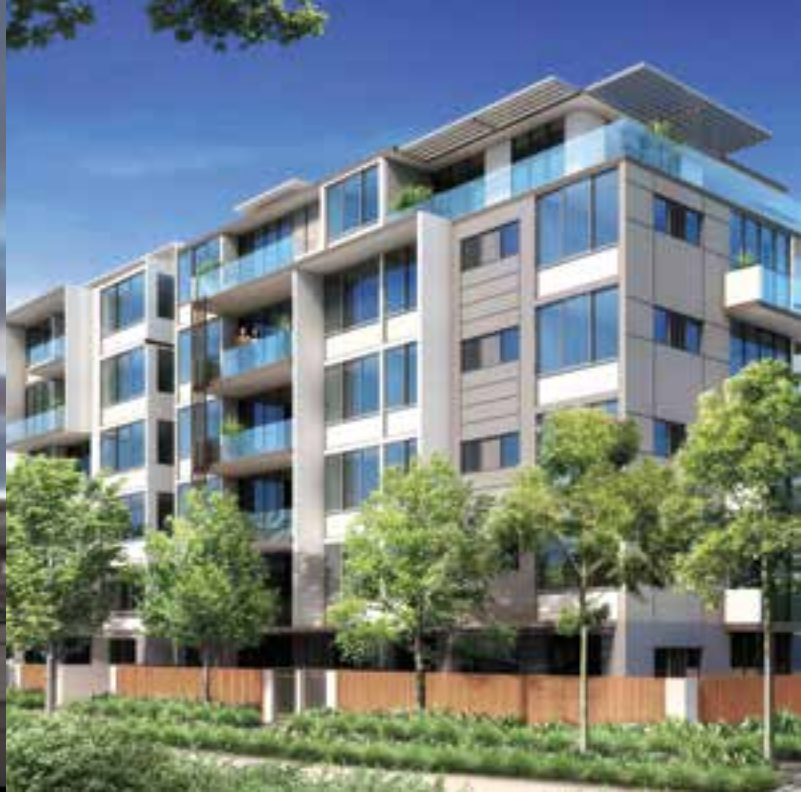
Epping Park by Meriton Apartments.